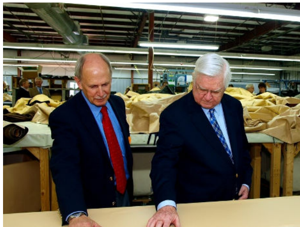
Rep. Hal Rogers (R-KY), right, at Outdoor Ventures.

Since 1968, KHIC has invested more than $275 million in over 633 businesses, including 209 agricultural-related businesses. On average, KHIC provides management assistance to 140 businesses and 15 economic and community development organizations each year. Over its 45-year history, KHIC has helped small businesses create more than 19,000 jobs for people living in an area where few quality employment opportunities exist. KHIC's current $49.6 million business loan portfolio has over 360 loans and equity investments and has helped create or retain in excess of 11,600 jobs.