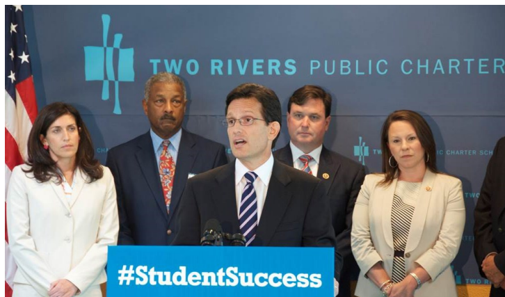
Rep. Eric Cantor (R-VA) speaks at Two Rivers.