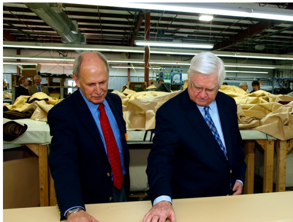
Rep. Hal Rogers (R-KY), right, at Outdoor Ventures.

Since 1968, KHIC has invested more than $275 million in over 633 businesses, including 209 agricultural-related businesses. On average, KHIC provides management assistance to 140 businesses and 15 economic and community development organizations each year. Over its 45-year history, KHIC has helped small businesses create more than 19,000 jobs for people living in an area where few quality employment opportunities exist. KHIC's current $49.6 million business loan portfolio has over 360 loans and equity investments and has helped create or retain in excess of 11,600 jobs.