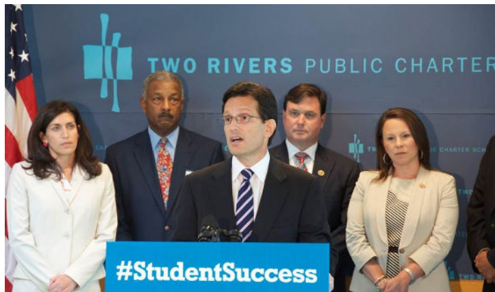
Rep. Eric Cantor (R-VA) speaks at Two Rivers.